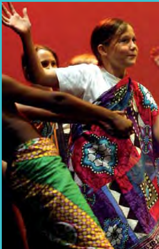
▶ All Saints C of E School performing their music with movement piece Salam Alekum at the South East Artsmark celebration event, June 2006.

We define learning outside the classroom as: