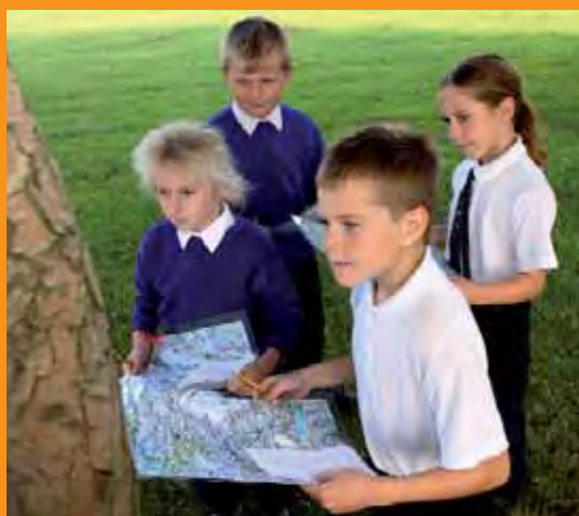
► Image provided by the Geographical Association, Action Plan for Geography

Encourage the use of 'safety badges', showing that external providers manage safety appropriately, so schools can use them without seeking more detailed assurances.